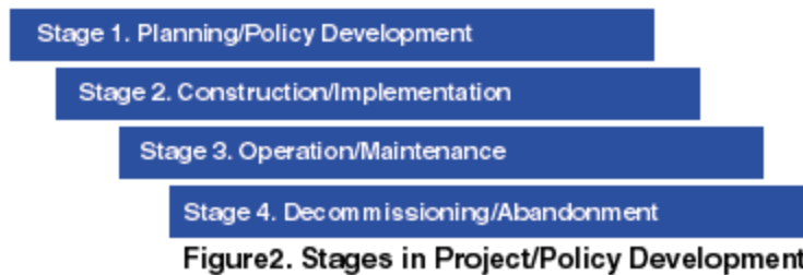
Figure2. Stages in Project/Policy Development

We use a comparative SIA method to study the course of events in a community where an environmental change has occurred, and extrapolate from that analysis what is likely to happen in another community where a similar development or policy change is planned. Put another way, if we wish to know the probable effects of a proposed project in location B, one of the best places to start is to assess the effects of a similar project that has already been completed in location A. Specific variables to assess project impacts are shown later in this section.